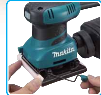
Easy-to-Operate Paper Clamp (BO4555 and BO4556) Easy installation/removal of paper with rolled clamper's edges